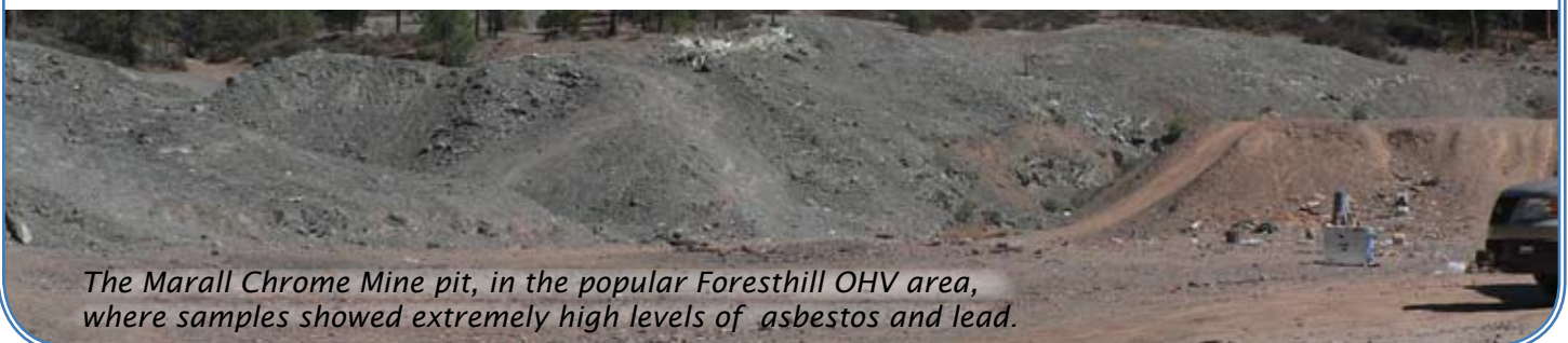
The Marall Chrome Mine pit, in the popular Foresthill OHV area, where samples showed extremely high levels of asbestos and lead.

See table on the reverse for a detailed summary of results.