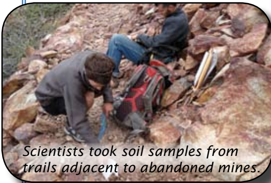
Scientists took soil samples from trails adjacent to abandoned mines.